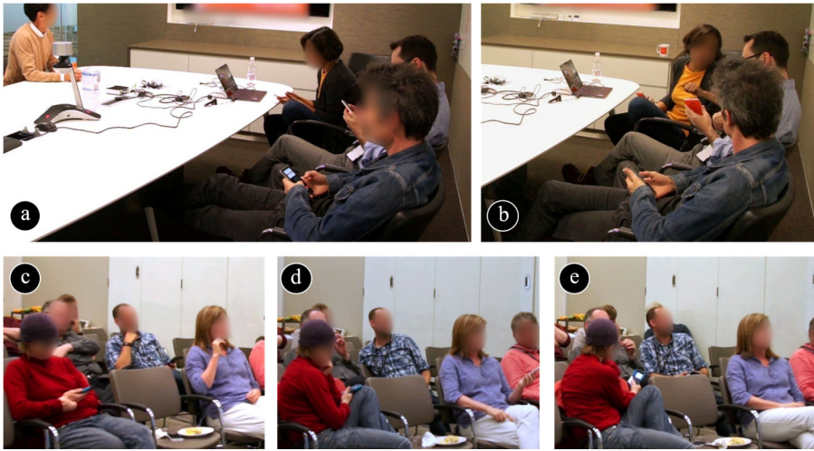
Figure 3. Review of content facilitated small-group discussions in ad-hoc F-formations: side-by-side (a–b) and L-shaped (c–e).

L-shaped formation to discuss content around the slides available on the phone (Figures 3c–e). In both cases, the formations, afforded by the micro-mobility of smartphones [9], were ad-hoc and short-lived, quickly emerging out and merging back into the ecosystem.