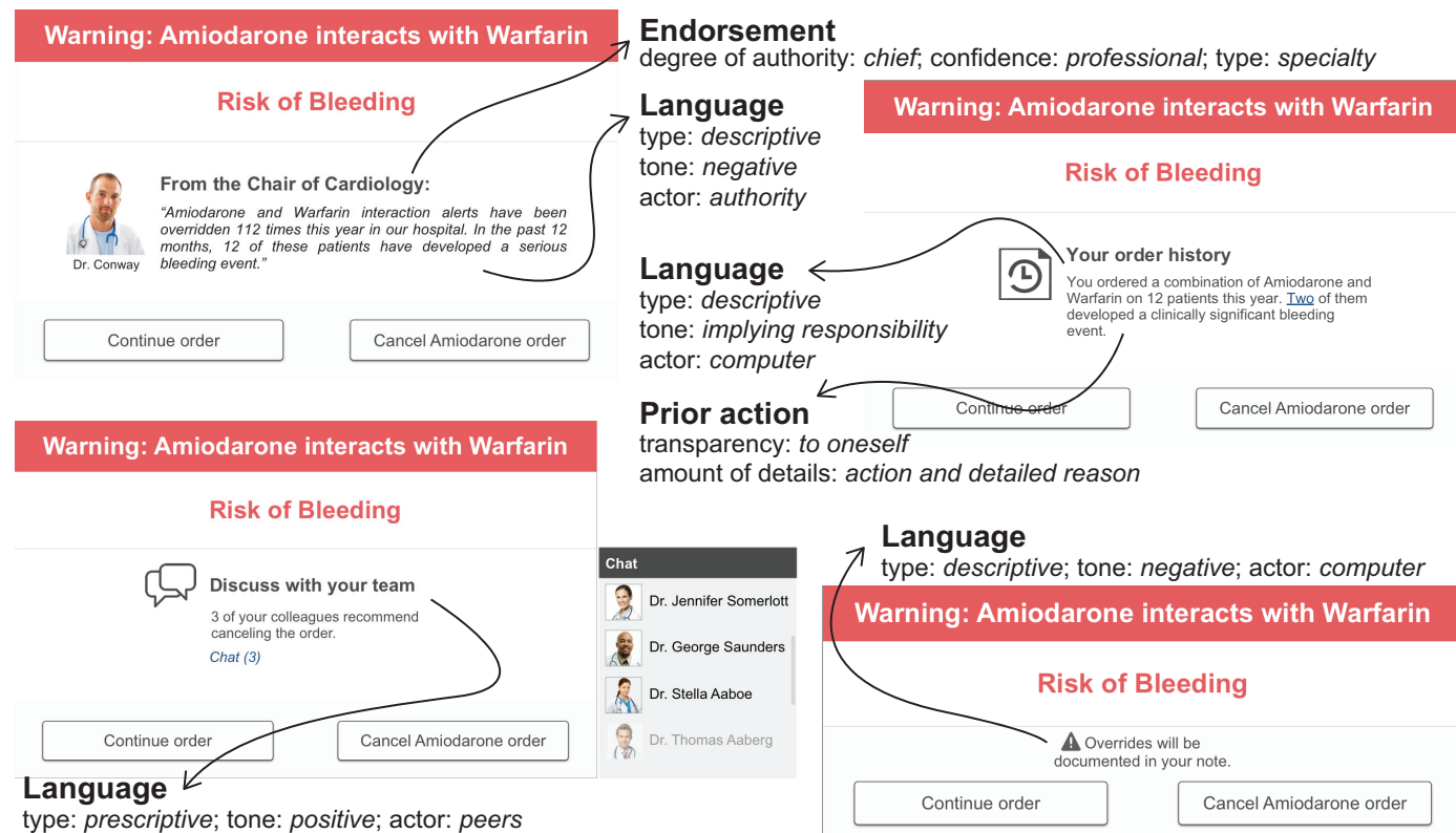
Figure 3. Example prototypes of trust-based alerts designed using our proposed model. Alerts can be designed combining any one, two, or all of the three dimensions. Example parameters of the different sub-dimensions are listed in Tables 1–3.

advice, such as endorsed alerts, transparent alerts, or empathic alerts [3], and then parametrize the available dimensions to craft design prototypes. The three trust-eliciting elements in our model, which can be alternated and modified, opens up a rich design space of trust-based alerts, thus not habituating physicians with alerts that look the same.